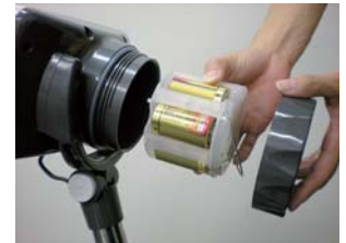
Easily removable battery unit