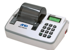
AD-8127 Compact Printer