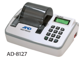
AD-8127 Compact Printer