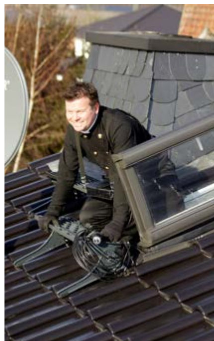
No unnecessary ballast on the roof – helps you keep your balance in the most difficult of conditions.