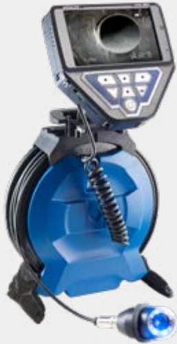
Wohler VIS 400 Push rod Camera