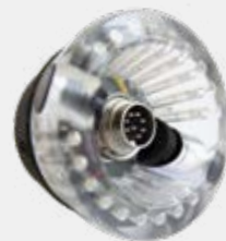
Detachable Wohler Supplementary light for 2" dia color camera head

1" dia color camera head for smaller pipe diameters