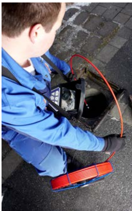
Professionally equipped with camera viper for inspecting underground pipelines.