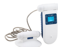
Remote Sensor Kit AS R10