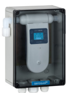
Industrial Enclosure HH ENC