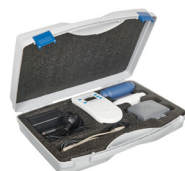
Carry Case Small AS R40