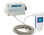
IP41 Remote Sensor Kit AS R13