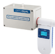
Calibration Kit AS R42