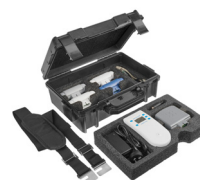
Carry Case Large AS R41