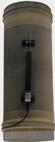
Fig 1. Axial Hall Effect