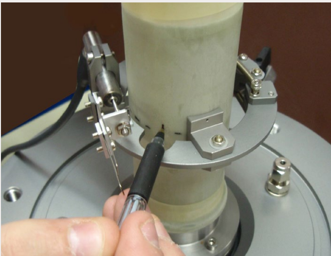
Fig 4 Radial LVDT

As shown in Fig. 3, the axial LVDT is suspended from an upper pad fixed to the test specimen by pins and bonded to the membrane by adhesive. The LVDT armature has a weighted rounded brass end, which rest freely on the lower pad anvil. Aluminium fixing struts may be attached between the upper and lower pads to allow help alignment of the pads when being fixed in place. Once in position, the fixing struts may be removed.