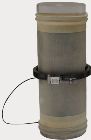
Fig 2. Radial Hall Effect

The lower part of the gauge consists of a metallic container holding the linear output Hall Effect semiconductor encapsulated in epoxy resin. This is mounted on the specimen by means of a pinned fixing pad (Clayton & Khatrush, 1986).