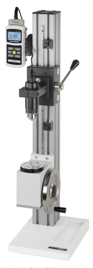
The TST is shown with a Series R50 torque sensor and Model M5i force/torque indicator