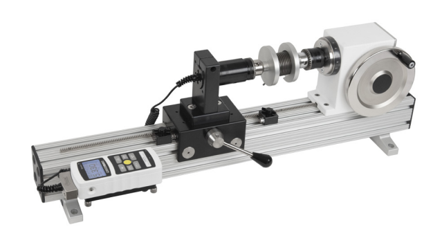
The TSTH is shown in a torsion spring test, with Series R50 torque sensor and Model M5i force/torque indicator