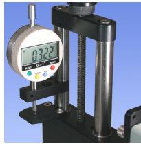
Digital travel indicator