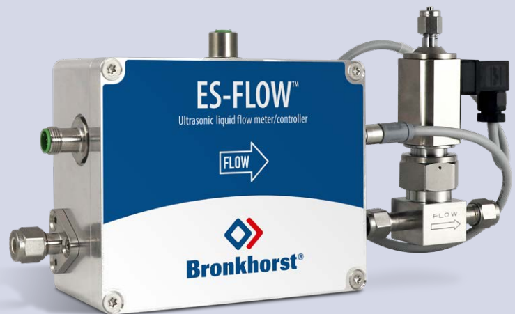
ES-113C/C21 Liquid Flow Controller