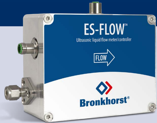
ES-113C Ultrasonic Liquid Flow Meter

Liquids can be measured independent of fluid density, temperature and viscosity, therefore recalibration per fluid is unnecessary. The flow meter has a straight sensor tube design with the actuators positioned at the outer surface. Therefore, the instrument is easy to clean. All wetted parts are made of stainless steel, build in an aluminium housing. The on-board PID controller can be used to drive a control valve or pump, enabling users to establish a complete, compact control loop.