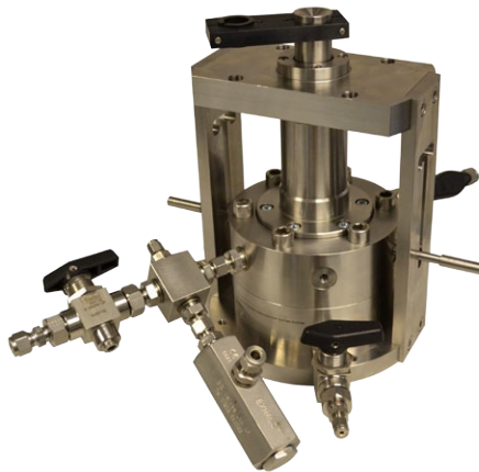
Fig 2. High pressure cell (20MPa)