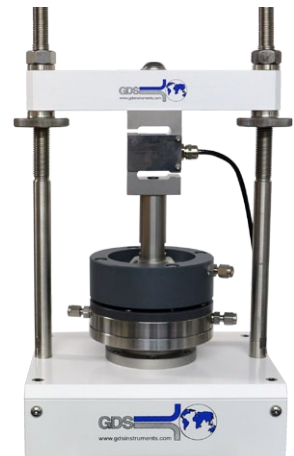
Fig 3. Open-topped CRS