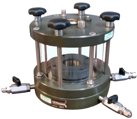
Fig 1. Low/Medium pressure cell (1 and 3MPa)

A GDS pressure controller is used to apply the back pressure. A standard load frame controls the vertical stress and strain, with strain rates typically up to 100mm/min. A force transducer placed at the end of a piston measures the force, and pore pressure is measured by a transducer connected to the base filter stone. The sample itself is confined between two porous plates in a steel ring, which prevents horizontal deformation and reduces friction. The low/medium pressure cells (see Fig.1 below) are designed to be used with an internal submersible load cell, whereas the high pressure version (see Fig.2 below) is used with an external load cell only. GDS also have the option for an open-topped CRS cell see Fig 3. This is like a traditional oedometer cell but has a sealed lower porous disc allowing pore pressure measurements to be taken at the base of the specimen.