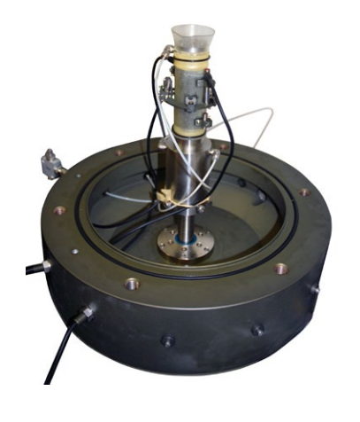
Fig 1. Shows the setup of local strain transducers (LVDT's mounted onto a specimen), as can be seen the cables for the LVDT's pass through the access ring, which allow the transducers to be situated inside the cell without the need for internal connections.