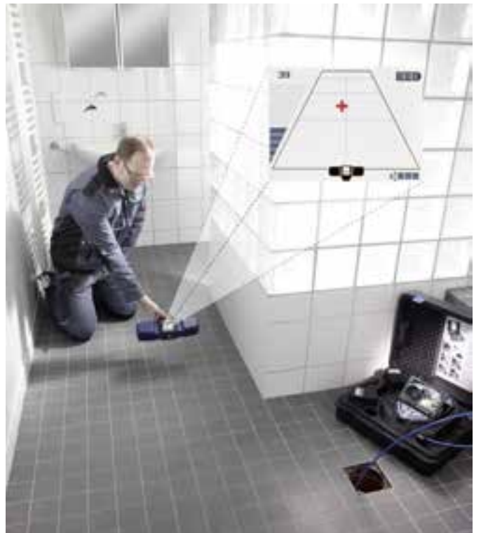
The actual meter count and the position of the head are displayed in the monitor. The Wohler L 200 Locator makes it possible to locate the camera head wirelessly.