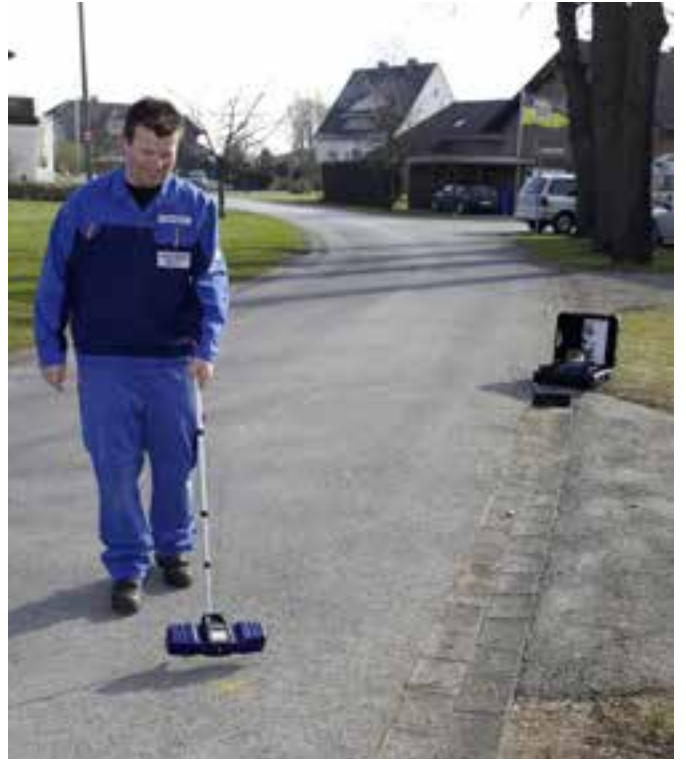
The Wohler VIS 350 precisely locates radio waves transmitted by the camera head through concrete and asphalt to save a lot of time and further building damage.